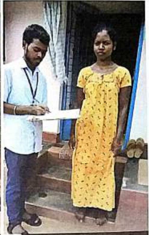
Nandiguda, Andhra Pradesh, India Unnamed Road, Nandiguda, Andhra Pradesh 531001 Lat 18.295733° Long 82.891081° 04/09/22 10:16 AM