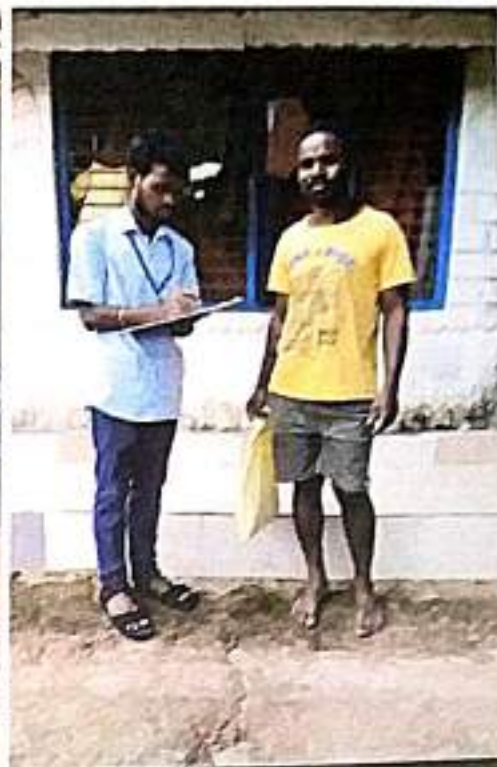
Nandiguda, Andhra Pradesh, India Unnamed Road, Nandiguda, Andhra Pradesh 53 Lat 18.295937° Long 82.890257° 04/09/22 09:53 AM