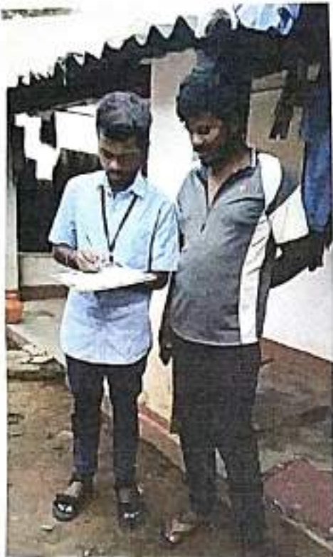
Nandiguda, Andhra Pradesh, India Unnamed Road, Nandiguda, Andhra Pradesh 531001 Lat 18.295963° Long 82.891329° 04/09/22 10:19 AM