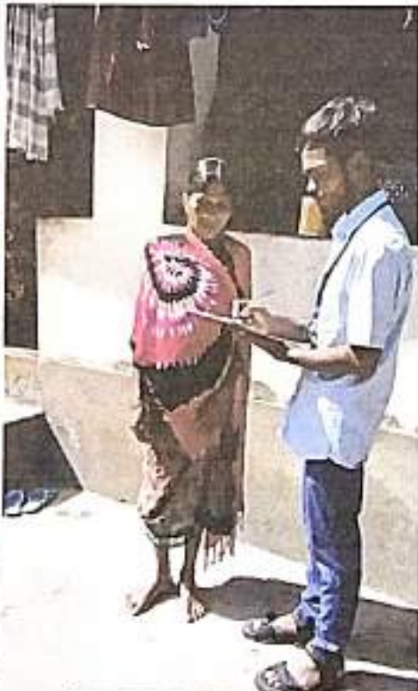
Nandiguda, Andhra Pradesh, India 7VXQ+FG, Nandiguda, Andhra Pradesh 53 Lat 18.296604° Long 82.890132° 04/09/22 09:23 AM