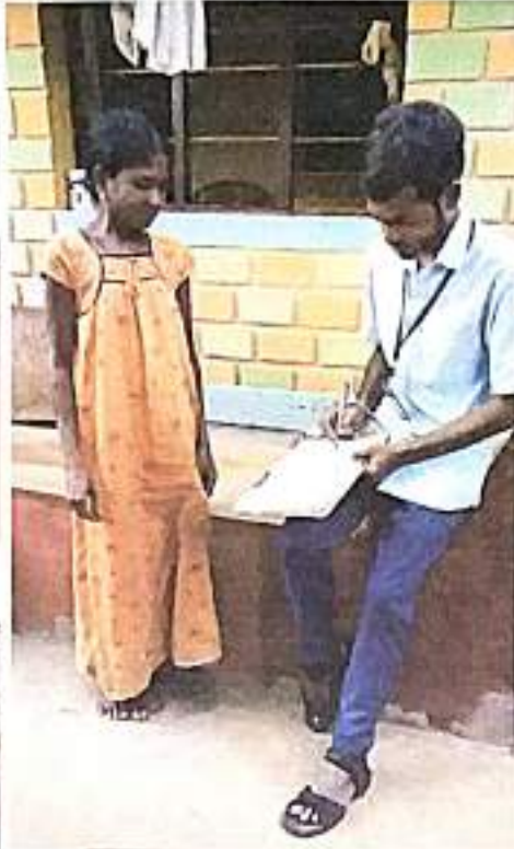
Nandiguda, Andhra Pradesh, India Unnamed Road, Nandiguda, Andhra Pradesh 53 Lat 18.296035° Long 82.891187° 04/09/22 10:21 AM