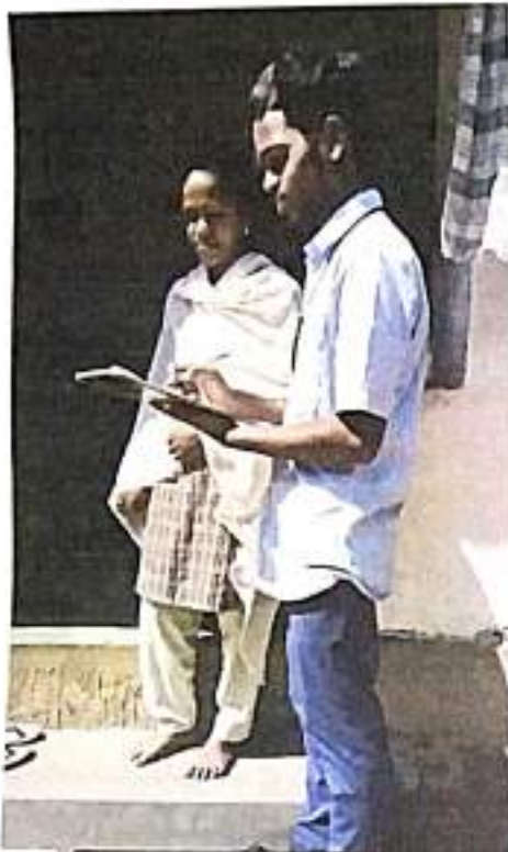
Nandiguda, Andhra Pradesh, India 7VXQ+FG, Nandiguda, Andhra Pradesh 53 Lat 18.296608° Long 82.89015° 04/09/22 09:28 AM