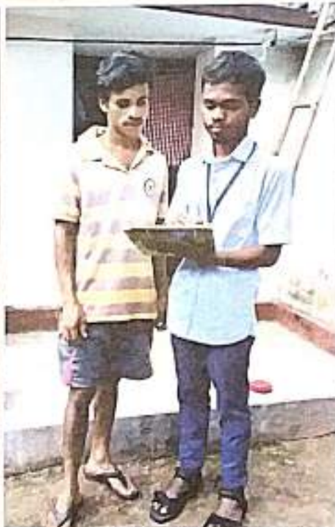
Nandiguda, Andhra Pradesh, India 7VXQ+FQ, Nandiguda, Andhra Pradesh 53 Lat 18.286461° Long 82.89006° 04/09/22 09:32 AM