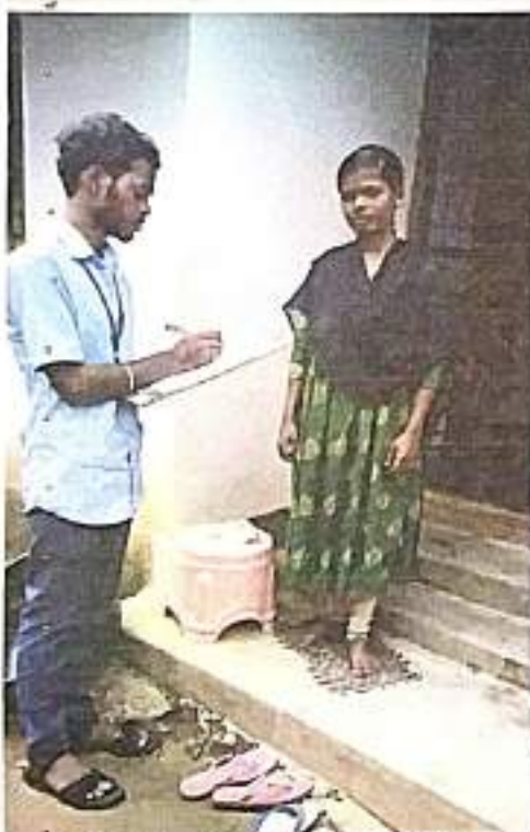
Nandiguda, Andhra Pradesh, India 7VXQ+FQ, Nandiguda, Andhra Pradesh 53 Lat 18.286358° Long 82.890257° 04/09/22 09:36 AM