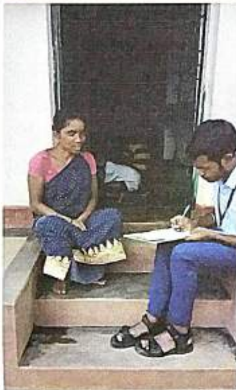
Nandiguda, Andhra Pradesh, India Unnamed Road, Nandiguda, Andhra Pradesh 531001 Lat 18.295741° Long 82.891052° 04/09/22 10:15 AM