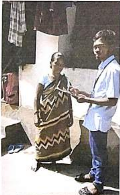
Nandiguda, Andhra Pradesh, India 7VXQ+FG, Nandiguda, Andhra Pradesh 53 Lat 18.296613° Long 82.890143° 04/09/22 09:23 AM