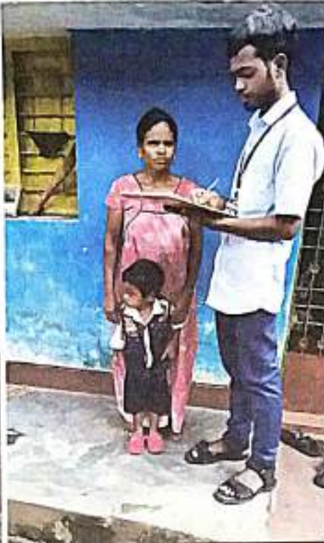
Nandiguda, Andhra Pradesh, India Unnamed Road, Nandiguda, Andhra Pradesh 531001 Lat 18.296058° Long 82.89126° 04/09/22 10:18 AM