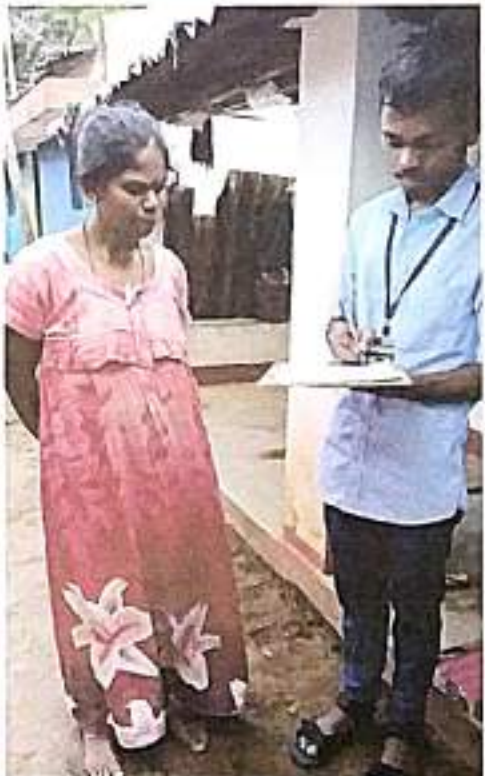
Nandiguda, Andhra Pradesh, India Unnamed Road, Nandiguda, Andhra Pradesh 53 Lat 18.295968° Long 82.89135° 04/09/22 10:20 AM