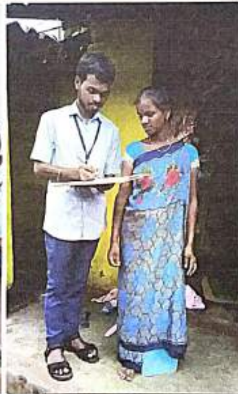
Nandiguda, Andhra Pradesh, India Unnamed Road, Nandiguda, Andhra Pradesh 531001 Lat 18.295835° Long 82.890862° 04/09/22 10:14 AM