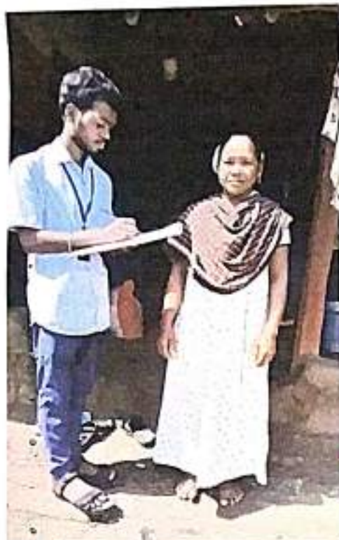
Nandiguda, Andhra Pradesh, India Unnamed Road, Nandiguda, Andhra Pradesh 53 Lat 18.295813° Long 82.890361° 04/09/22 09:57 AM