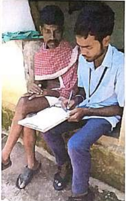
Nandiguda, Andhra Pradesh, India 7VXQ+FG, Nandiguda, Andhra Pradesh 53 Lat 18.296559° Long 82.890201° 04/09/22 10:58 AM